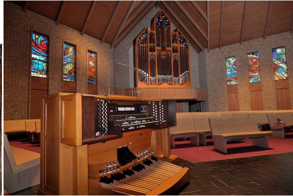
Braddock Street UMC