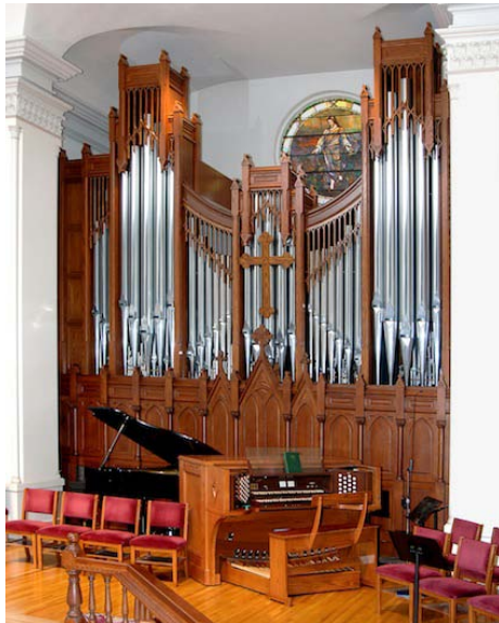
Grace Lutheran Church